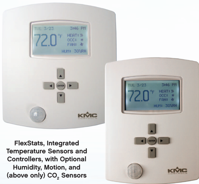
FlexStats, Integrated Temperature Sensors and Controllers, with Optional Humidity, Motion, and (above only) CO 2 Sensors

A complementary and far more sophisticated approach senses the gas that people breathe out. By measuring the levels of CO 2 , Demand Control Ventilation (DCV) estimates the amount of occupancy and required (healthy) levels of ventilation and adjusts the ventilation accordingly. SAE-1000 series CO 2 detectors provide CO 2 measurements in rooms or ducts to external controllers. FlexStats with the CO 2 sensor option integrate demand control ventilation with temperature and optional humidity control.