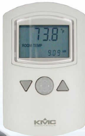
KMD-12x1 NetSensor with Motion Sensor

In building automation systems, sensors monitor air (temperature, humidity, CO 2 levels, CO levels, smoke, flow rate or pressure), water (temperature or pressure), or even motion/occupancy of people.