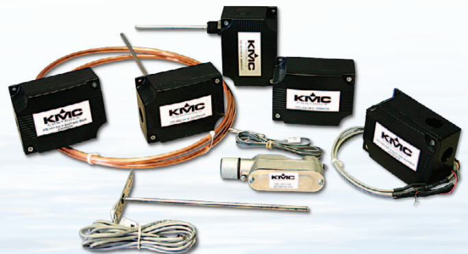
STE-1400 Series Temperature Sensors

Depending on the climate, however, temperature alone doesn't tell the whole story about human comfort. A (dry bulb) sensor temperature of 72° would feel very different to us at 10% relative humidity than it would at 90% relative humidity. Too much or too little humidity can be uncomfortable for people or even damaging to materials. KMC's THE-1xxx series humidity sensors can measure humidity in rooms or ducts. NetSensors and FlexStats with the optional humidity sensor measure and display room temperature as well as humidity.