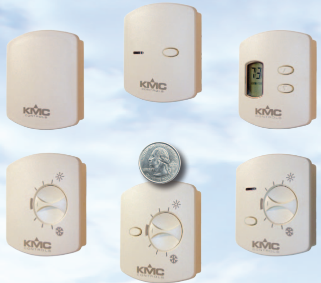
STE-6000 Series Room Temperature Sensors