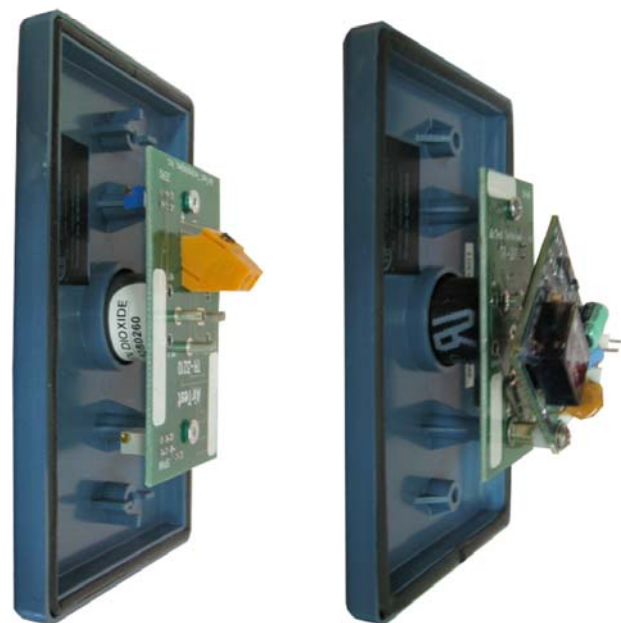
Current Output Version