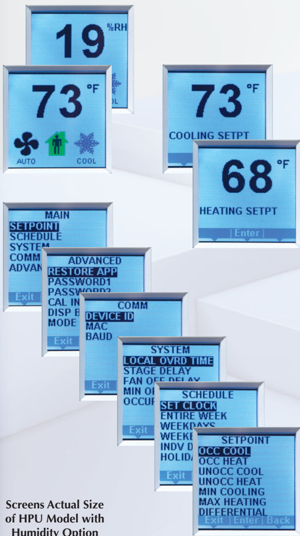
Screens Actual Size of HPU Model with Humidity Option

(For the branding and functionality needs of OEMs, KMC Controls offers additional services, ranging from private labeling to full product customization.)